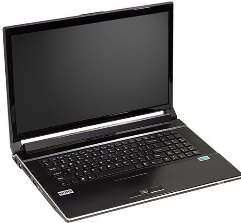
Keyboard Top View